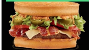
Spicy Sriracha Burger