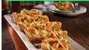
Sriracha Chicken Potato Skins