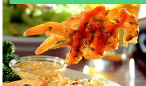
Sriracha Grilled Shrimp