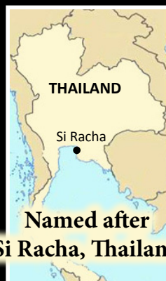
Named after Si Racha, Thailand